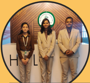
PLACEMENT & INTERNSHIP ATTACHMENTS