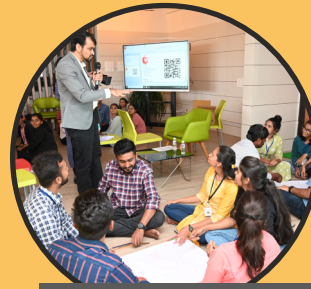
DESIGN THINKING & OPPORTUNITY VALIDATION