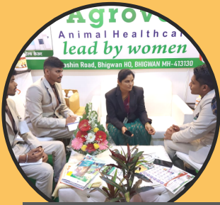
WORKSHOPS & TRAININGS