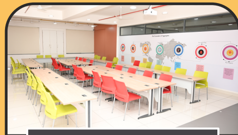
WELL EQUIPPED LABS